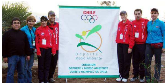
Celebrating World Environment Day in Chile