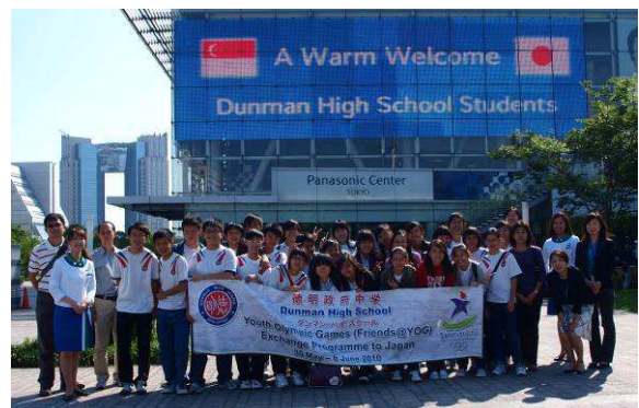
Singapore students in Japan