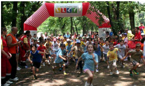
Start of the Olympic Day Run for Serbian children